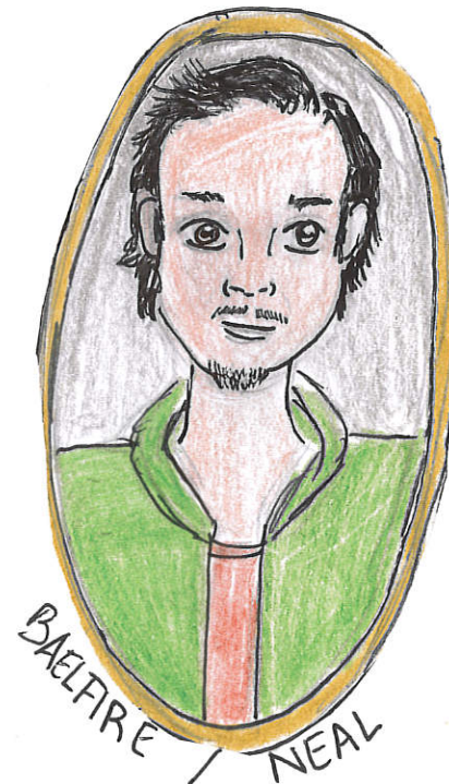
BAELFIRE / NEAL