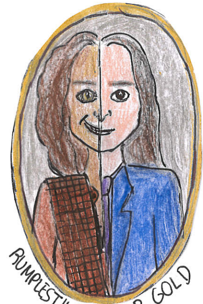
RUMPESTILSKIN / MR. GOLD