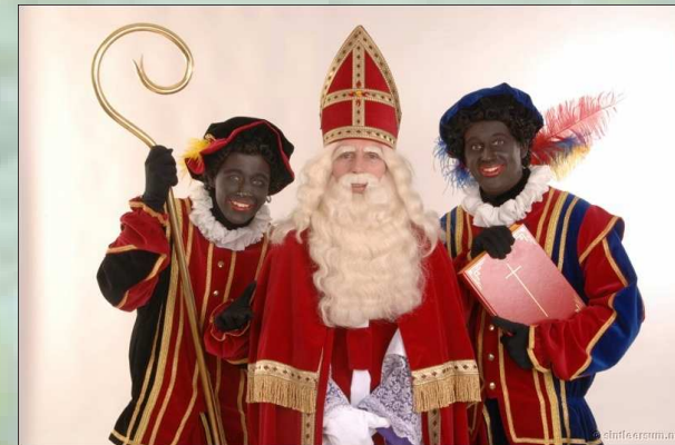
This is St. Nicolas.