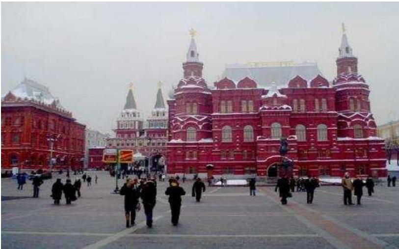
Red Square in Moscow

My favourite place is The Red Square in Moscow.