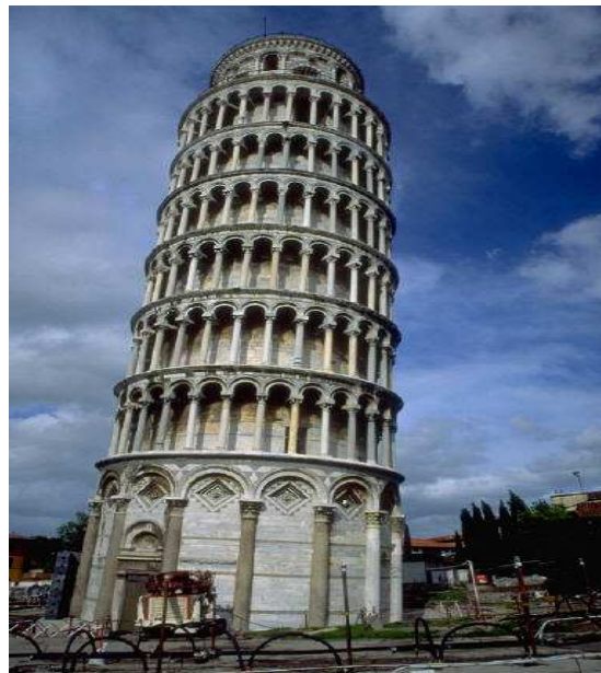
Pisa Tower is the most beautiful place

http://www.historycentral.com/nationbynation/Italy/Index.html http://goitaly.about.com/od/planningandinformation/p/italyprofile.htm