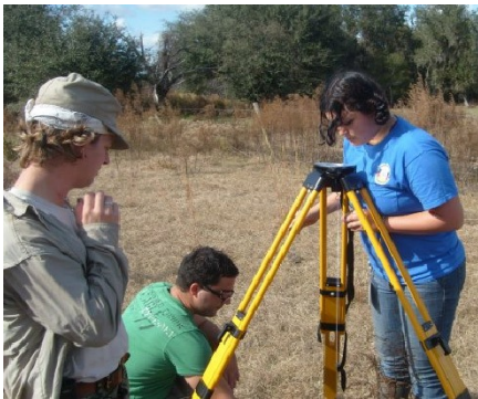
This is a total station