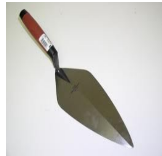
This is a trowel