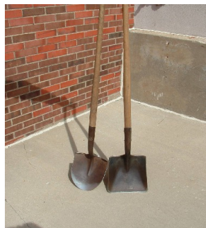
These are shovels