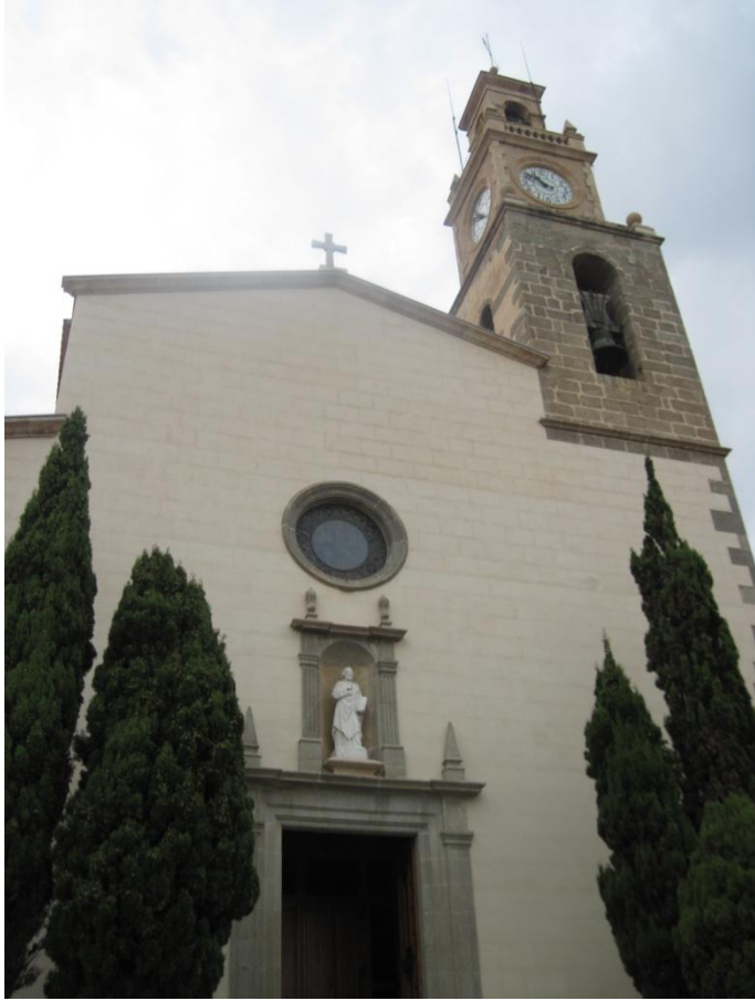
Sant Pere's Church

Built between 1760 and 1817. It was badly damaged by a fire during the Civil War and had to be rebuilt.